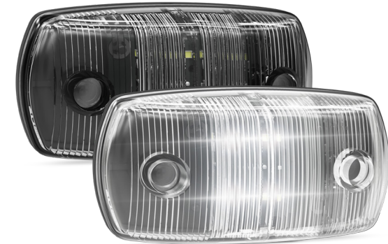
Part Number 69WM - Single Blister