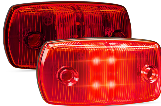
Part Number 69RM - Single Blister