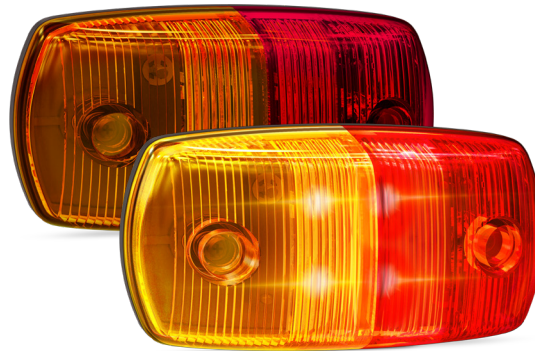
Part Number 69ARM - Single Blister