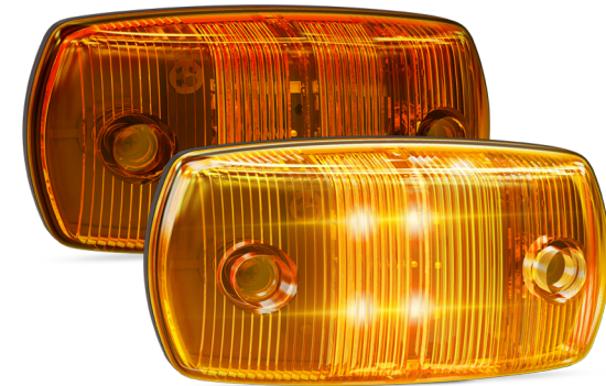
Part Number 69AM - Single Blister